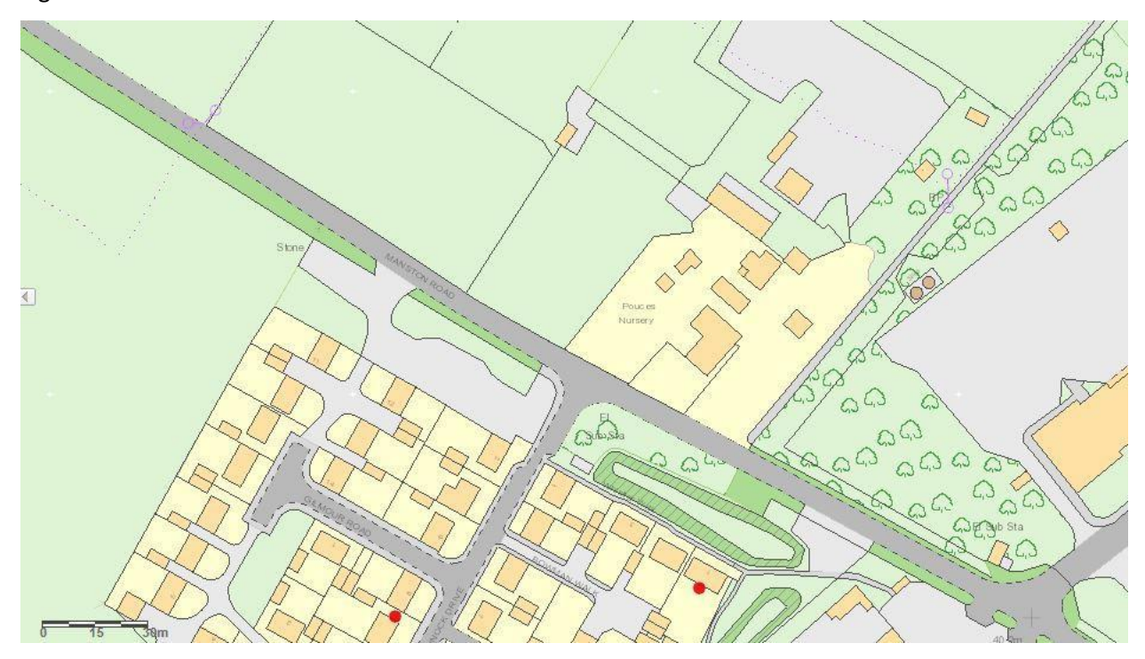
Figure 1: Site location in relation to OS map.