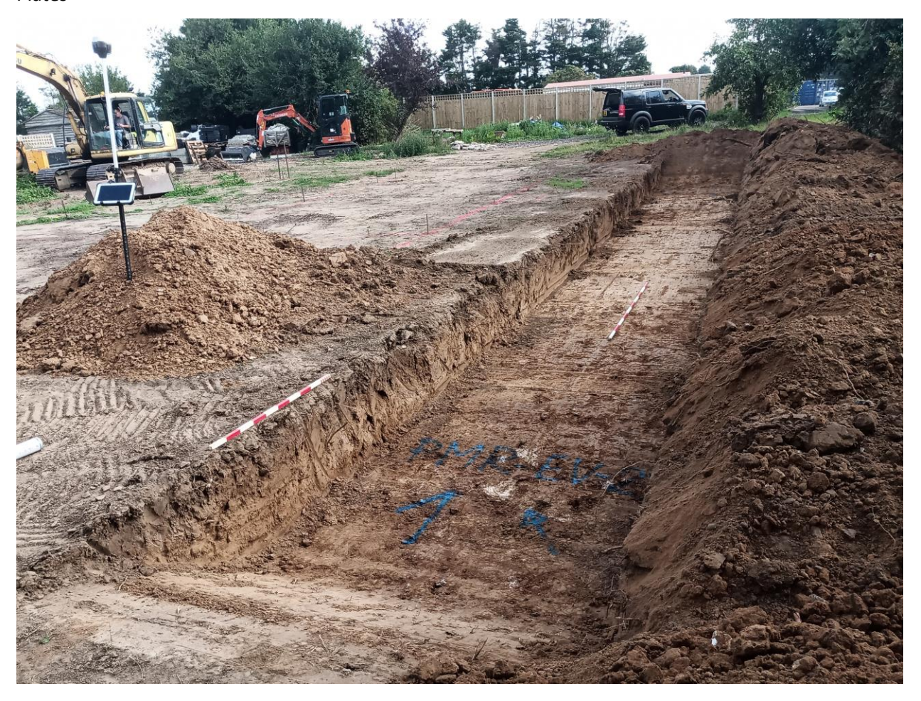
Plate 1: The site and evaluation trench viewed from the south with one- and two-metre scales.